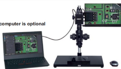
switchable LCD mode and computer mode (can't display both at the same time)