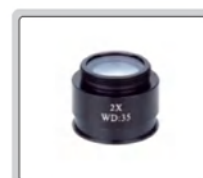
2X auxiliary objective (optional)