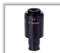
1X camera adapter (optional)