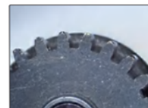
focus on the top