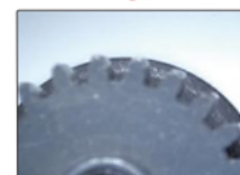
focus on the bottom