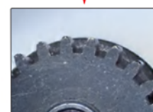
clear image of both top and bottom