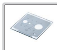
calibration plate (included)